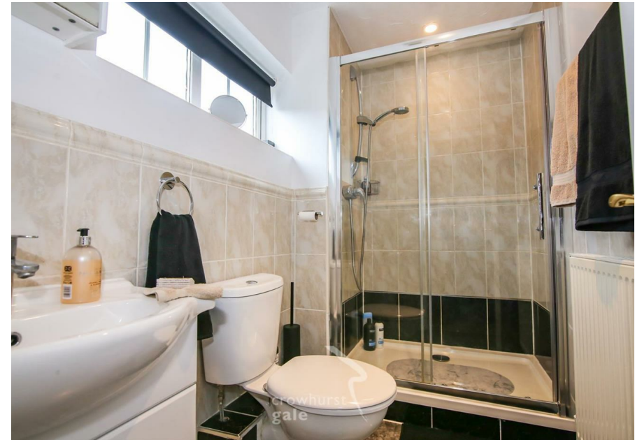
Energy Efficiency Rating